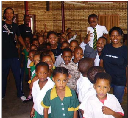
School learners in the Northern Cape at one of the live performances.

The provincial heads of NGOs, the SANDF, the SAAF, the SAPS, Correctional Services and local business leaders all form part of this committee.